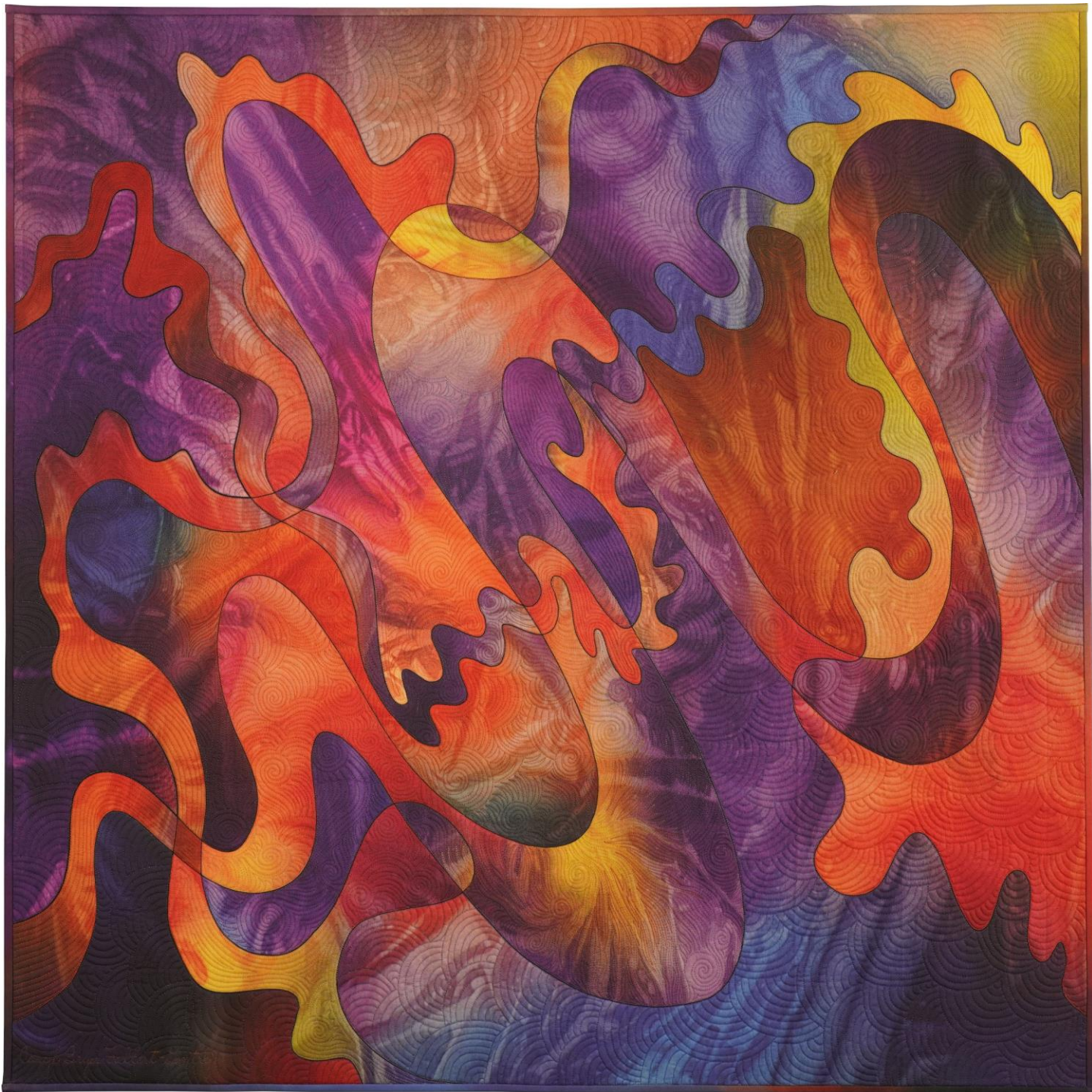
Where There's Smoke • 40" x 40" • Copyright 2024 Caryl Bryer Fallert-Gentry • www.bryerpatch.com

Bryerpatch Studio • 10 Baycliff Pl. • Port Townsend, WA 98368 • caryl@bryerpatch.com • www.bryerpatch.com