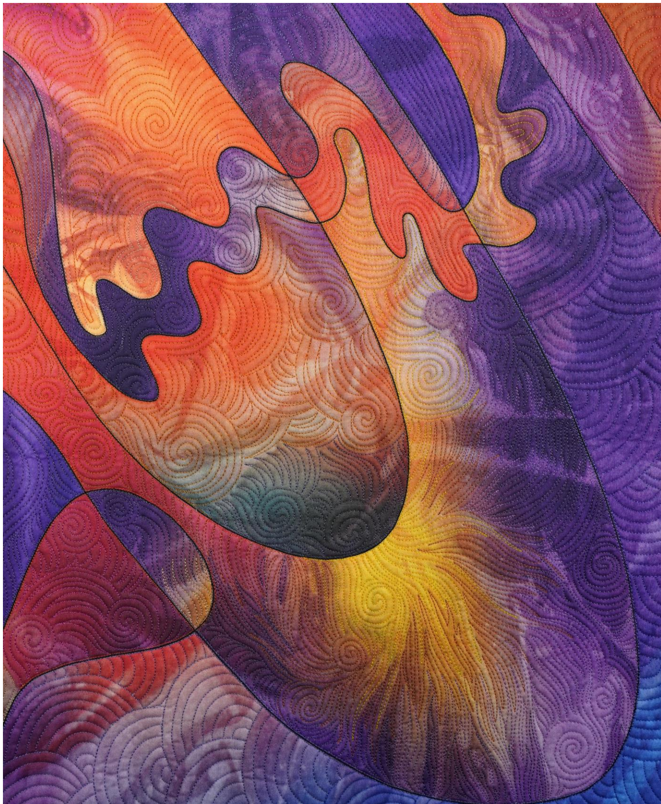
Where There's Smoke (detail) • 40" x 40" • Copyright 2024 Caryl Bryer Fallert-Gentry • www.bryerpatch.com

Bryerpatch Studio • 10 Baycliff Pl. • Port Townsend, WA 98368 • caryl@bryerpatch.com • www.bryerpatch.com