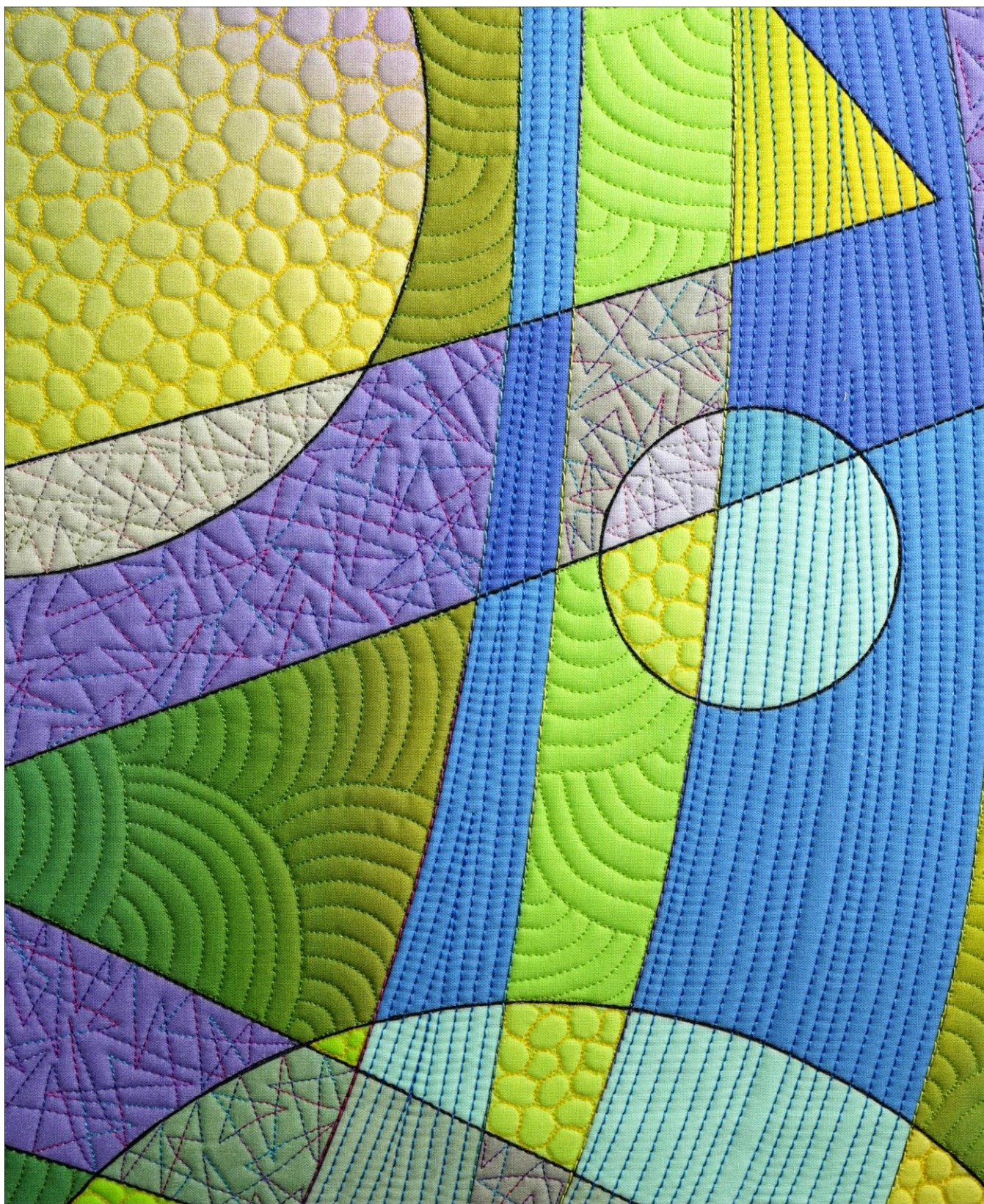
Zigzags & Circles #15 (detail) • 18" x 41" • Copyright 2025 © Caryl Bryer Fallert-Gentry • www.bryerpatch.com