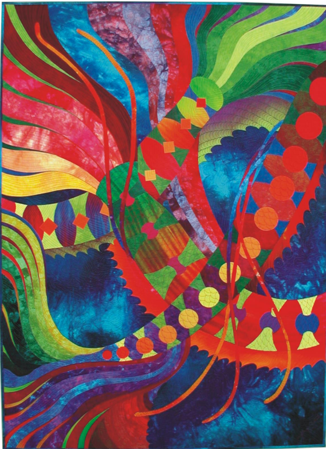
Aquarium #1: Fish Tails • 60" x 44" • Copyright © 2001 Caryl Bryer Fallert

Bryerpatch Studio • 10 Baycliff Pl. • Port Townsend, WA 98368 • caryl@bryerpatch.com • www.bryerpatch.com