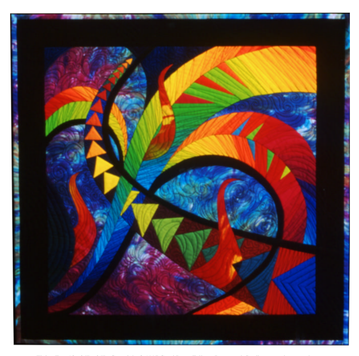
Flying Free #3 • 24" x 24" • Copyright © 1997 Caryl Bryer Fallert • Bryerpatch Studio • www.bryerpatch.com

Bryerpatch Studio - 502 N. 5th St. - Paducah, KY 42001 - 270-444-8040 - caryl @bryerpatch.com - www.bryerpatch.com