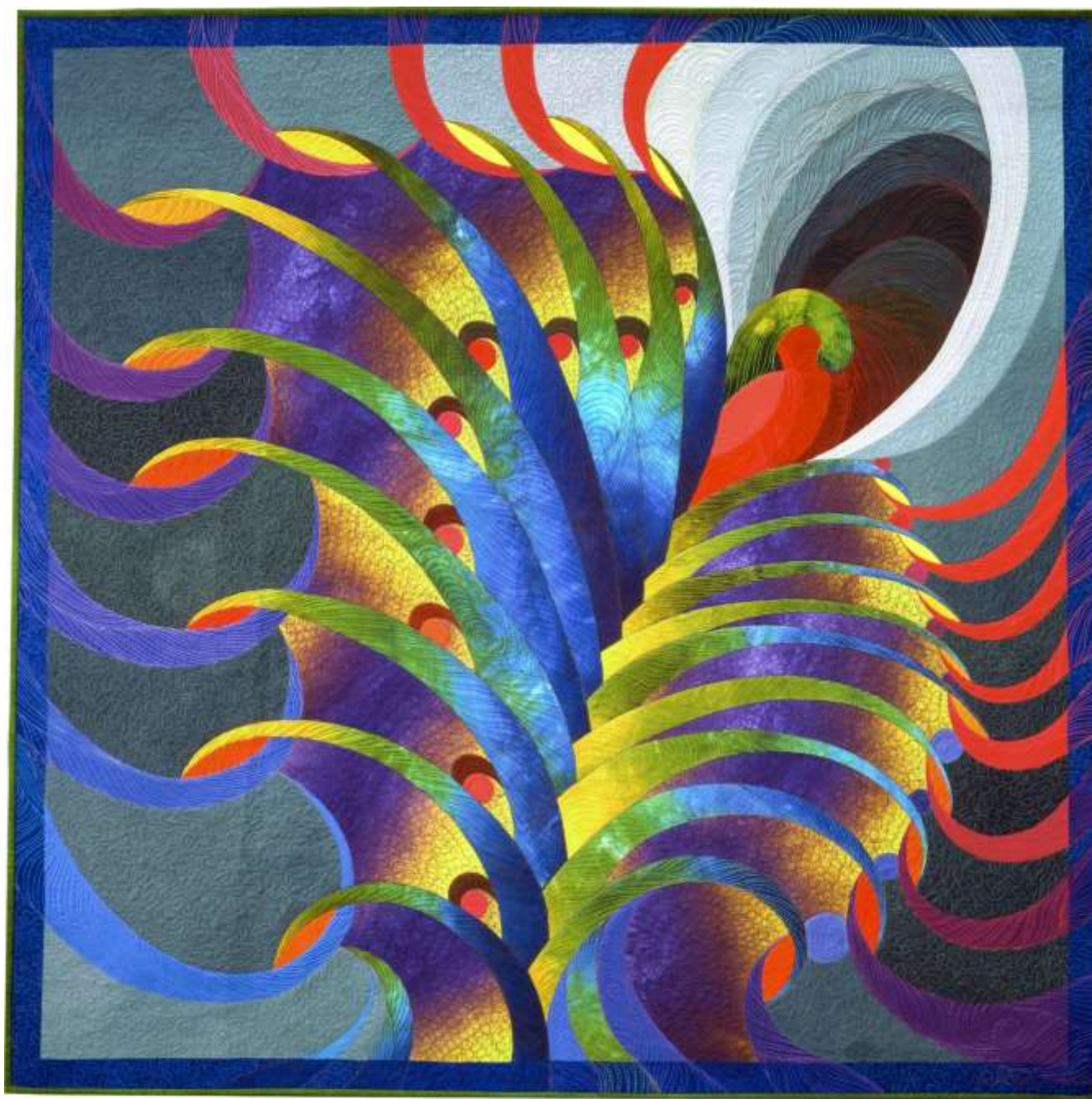
Feather Study #10 • 48" x 48" • Copyright © 1999 Caryl Bryer Fallert • Bryerpatch Studio • www.bryerpatch.com

Bryerpatch Studio • 10 Baycliff Pl. • Port Townsend, WA 98368 • caryl@bryerpatch.com • www.bryerpatch.com