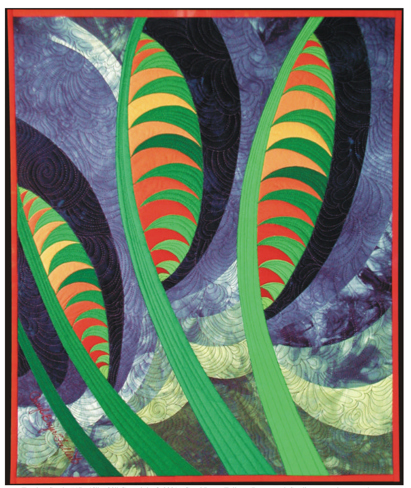
Feather Study #17 • 18" x 22" Copyright © 2001 • Caryl Bryer Fallert • Bryerpatch Studio • www.bryerpatch.com

Bryerpatch Studio - 502 N. 5th St. - Paducah, KY 42001 - 270-444-8040 - caryl @bryerpatch.com - www.bryerpatch.com