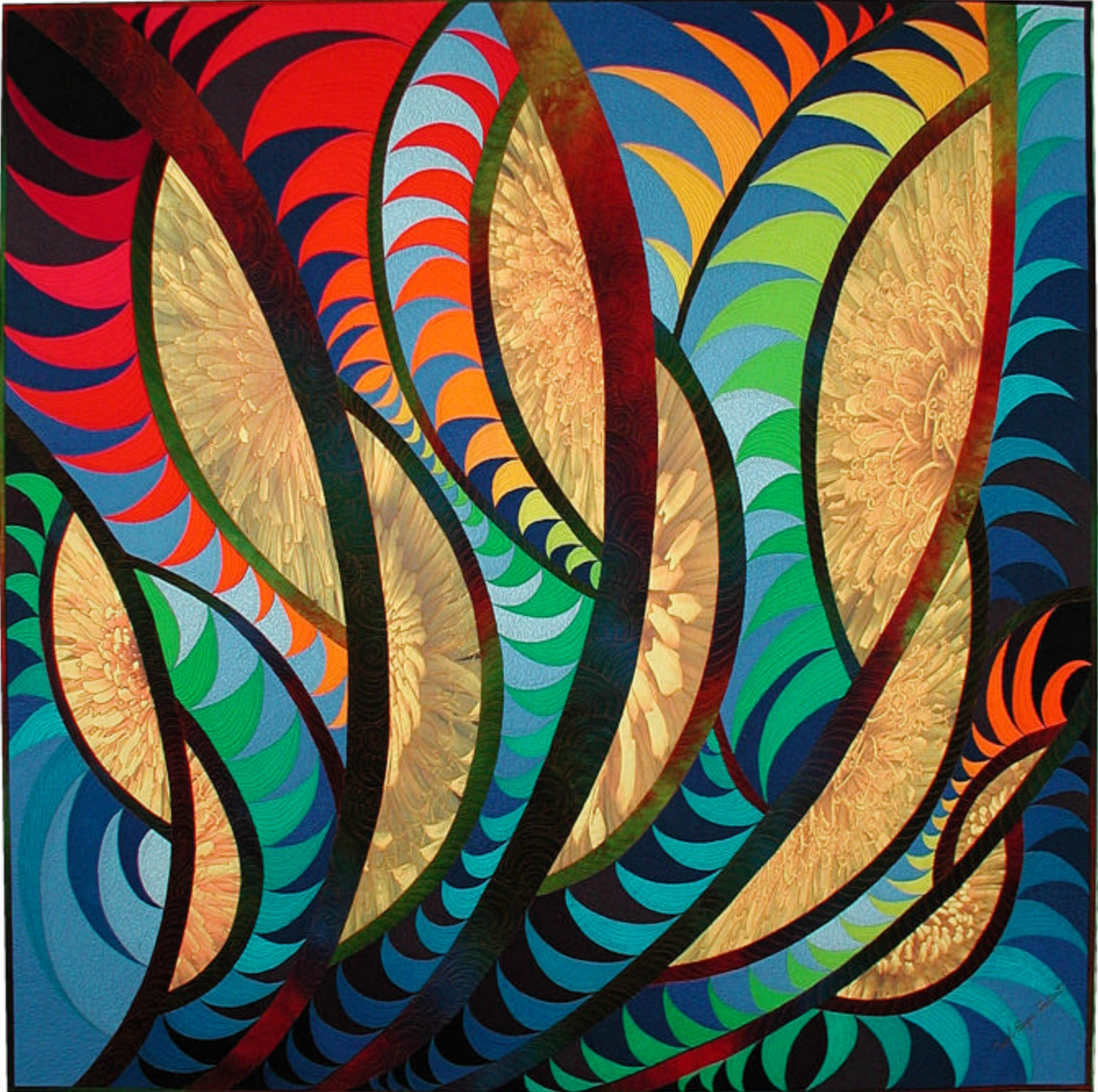
Feather Study #18 • 48" x 48" • Copyright © 2001 Caryl Bryer Fallert • Bryerpatch Studio • www.bryerpatch.com