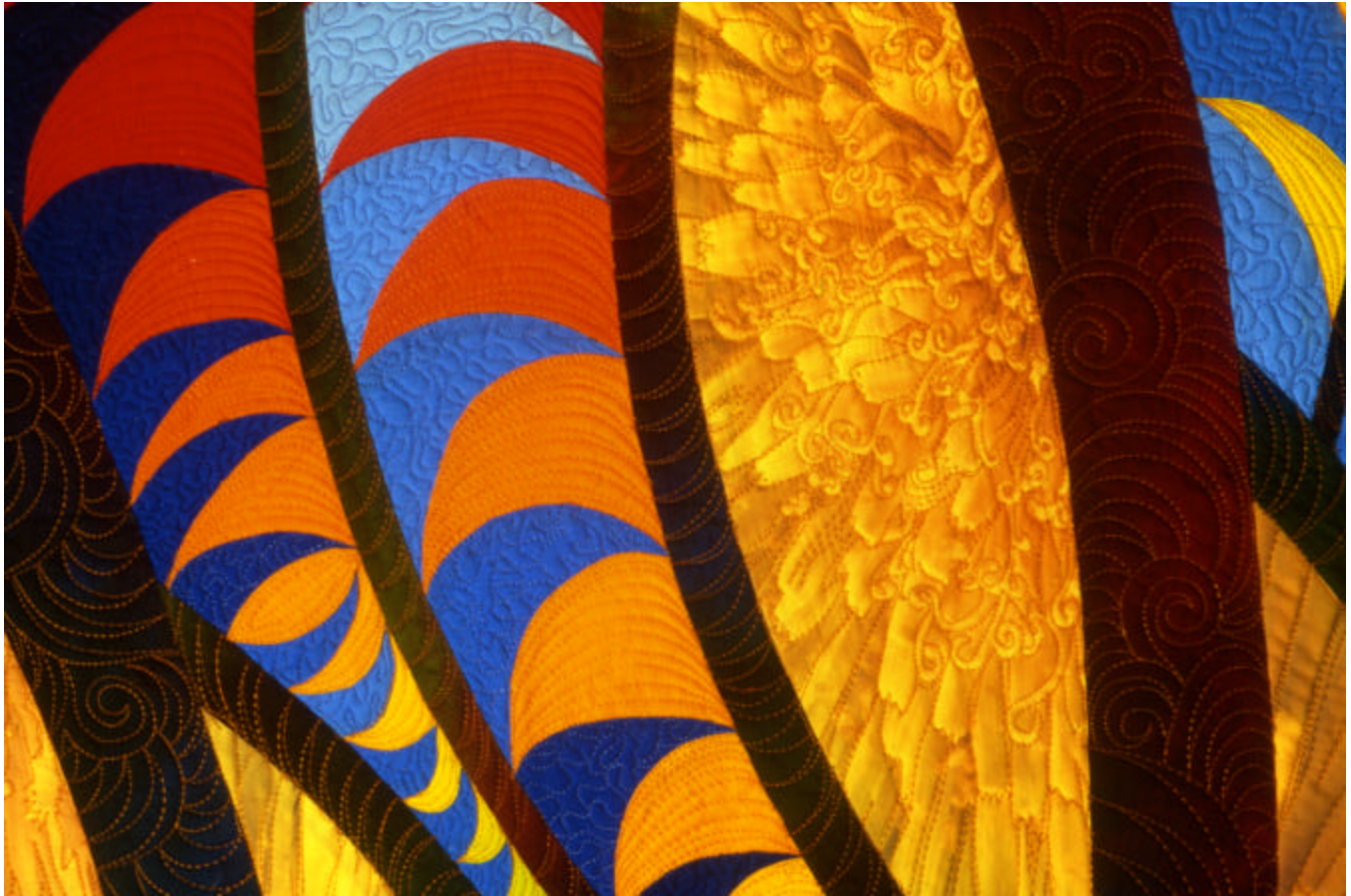
Feather Study #18 (detail) • 48" x 48" • Copyright © 2001 Caryl Bryer Fallert • Bryerpatch Studio • www.bryerpatch.com

Bryerpatch Studio • 502 N. 5th St. • Paducah, KY 42001 • 270-444-8040 • caryl@bryerpatch.com • www.bryerpatch.com