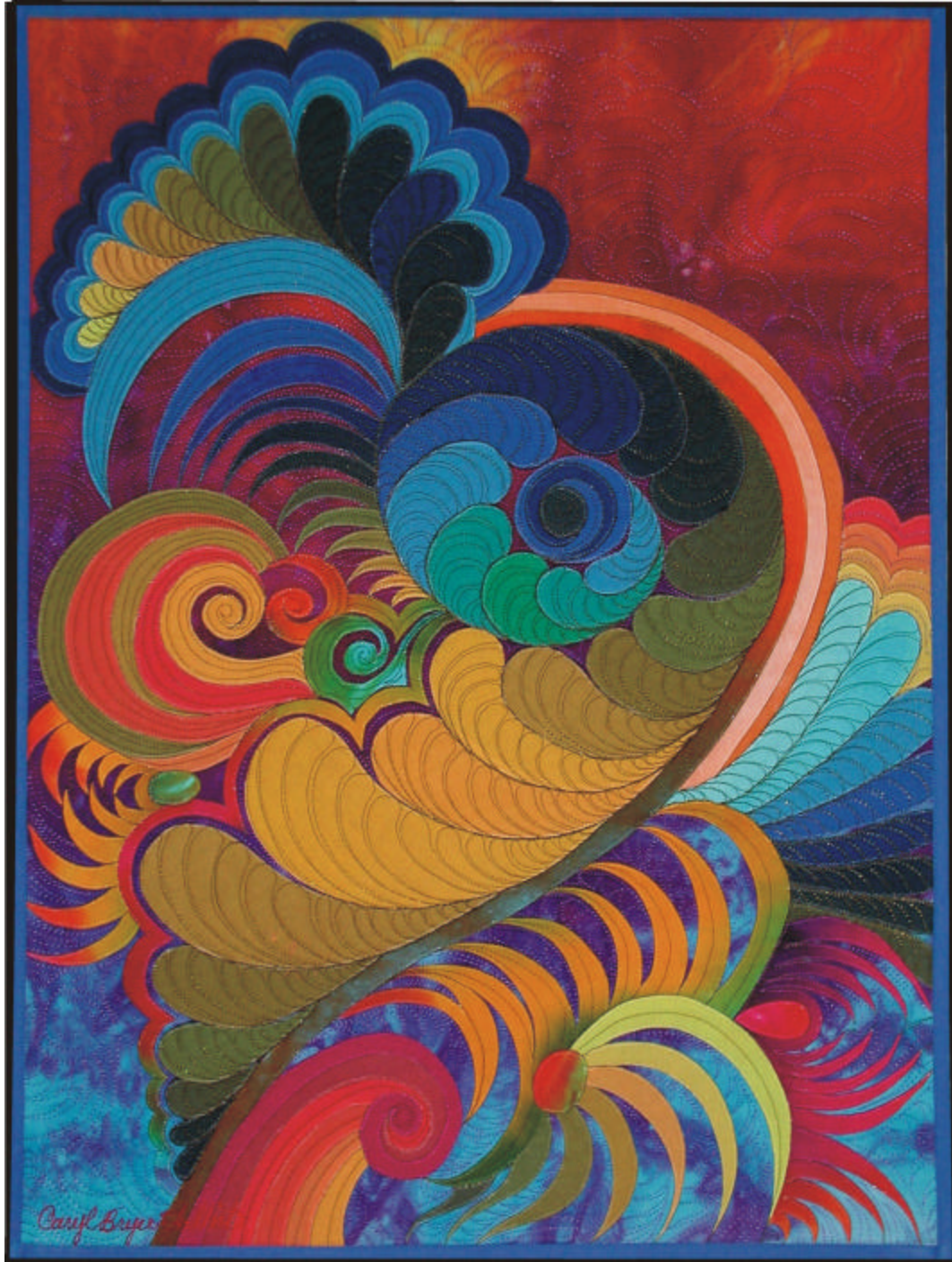
Feather Study #22 • 24" x 18" • Copyright © 2001 Caryl Bryer Fallert • Bryerpatch Studio • www.bryerpatch.com

Bryerpatch Studio • 502 N. 5th St. • Paducah, KY 42001 • 270-444-8040 • caryl@bryerpatch.com • www.bryerpatch.com