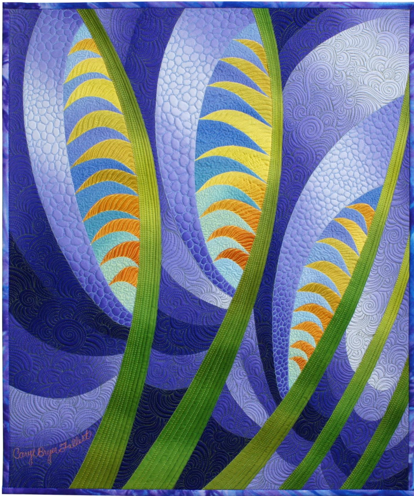
Feather Study #33 • 19.75" x 23.5" • Copyright © 2012 Caryl Bryer Fallert • Bryerpatch Studio • www.bryerpatch.com

Bryerpatch Studio • caryl@bryerpatch.com • www.bryerpatch.com