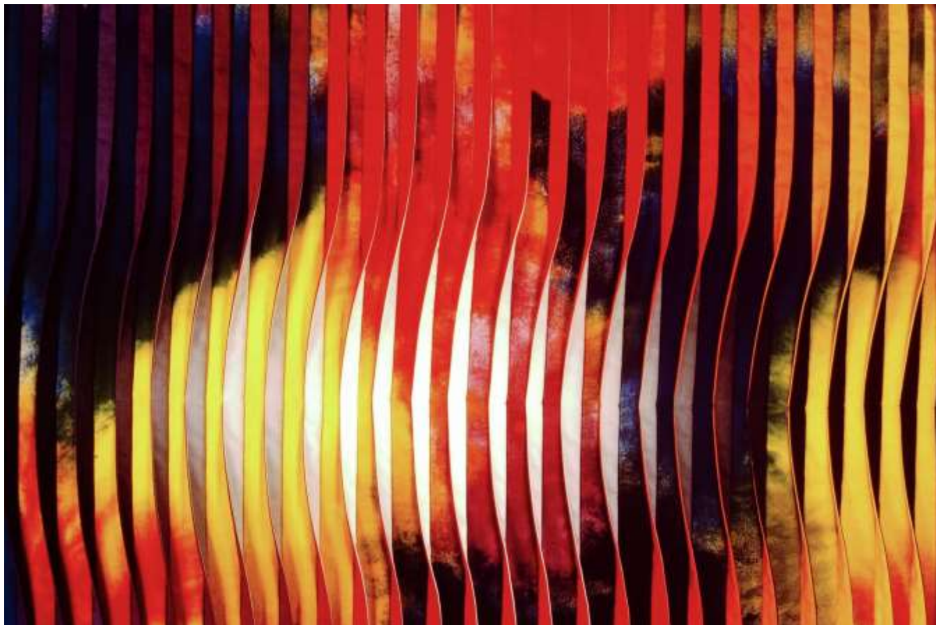
High Tech Tucks #14 • 48" x 63" • Copyright © 1989 Caryl Bryer Fallert • Bryerpatch Studio • www.bryerpatch.com

Bryerpatch Studio • 10 Baycliff Pl. • Port Townsend, WA 98368 • caryl@bryerpatch.com • www.bryerpatch.com