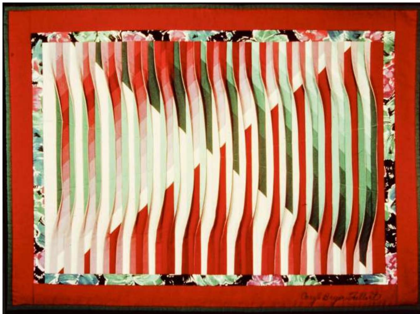
High Tech Tucks 29 • 23" x 31" • Copyright © 1991 Caryl Bryer Fallert • www.bryerpatch.com