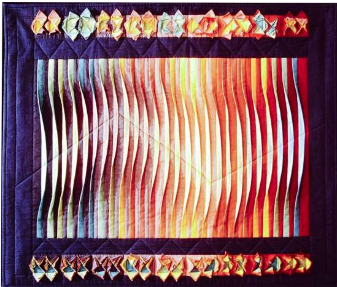
High Tech Tucks #8 • 27" x 32" • Copyright © 1988 Caryl Bryer Fallert • www.bryerpatch.com

Bryerpatch Studio • 10 Baycliff Pl. • Port Townsend, WA 98368 • caryl@bryerpatch.com • www.bryerpatch.com