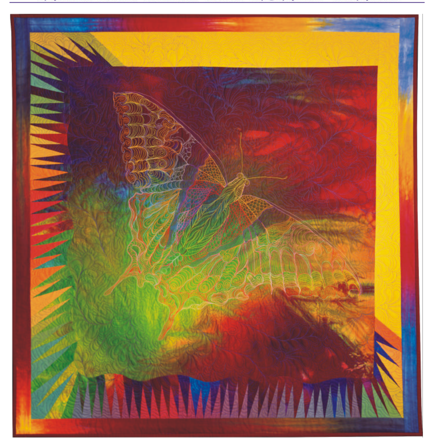
Lepidopteran #1 • 51" x 48" • Copyright © 1994 Caryl Bryer Fallert • Bryerpatch Studio • www.bryerpatch.com

Bryerpatch Studio • 502 N. 5th St. • Paducah, KY 42001 • 270-444-8040 • caryl @bryerpatch.com • www.bryerpatch.com