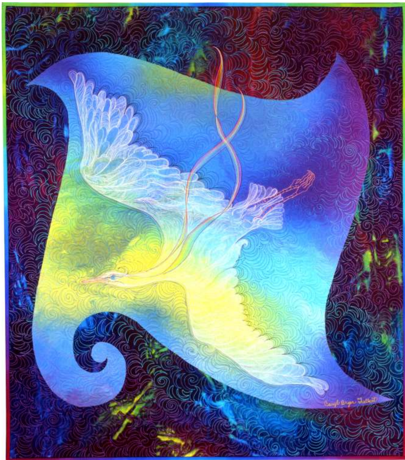
Contemplation of Flight • 20" x 20" • Copyright © 1995 Caryl Bryer Fallert • www.bryerpatch.com

Bryerpatch Studio • 10 Baycliff Pl. • Port Townsend, WA 98368 • caryl@bryerpatch.com • www.bryerpatch.com