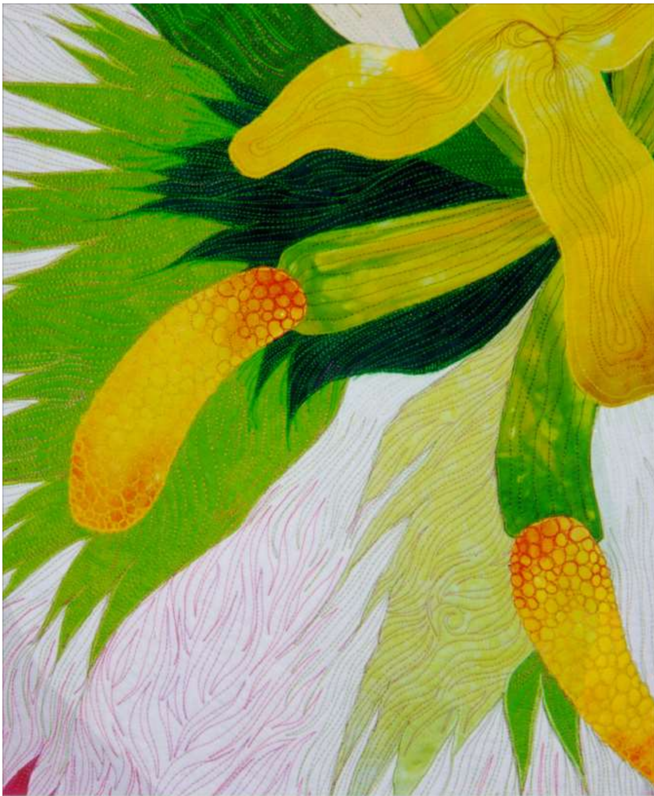
Skagit Valley Scarlet (detail) • 52" x 69", • Copyright © 1999 Caryl Bryer Fallert • Bryerpatch Studio • www.bryerpatch.com