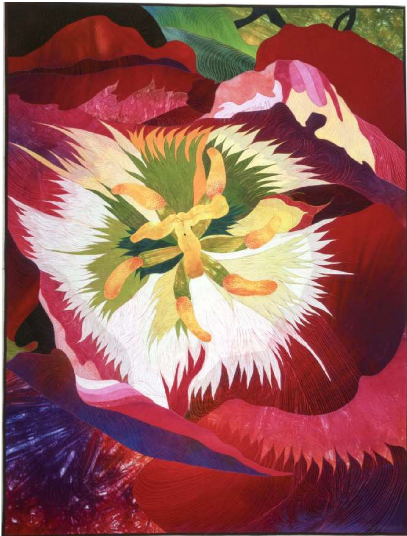
Skagit Valley Scarlet • 52" x 69", • Copyright © 1999 Caryl Bryer Fallert • Bryerpatch Studio • www.bryerpatch.com

Bryerpatch Studio • 10 Baycliff Pl. • Port Townsend, WA 98368 • caryl@bryerpatch.com • www.bryerpatch.com