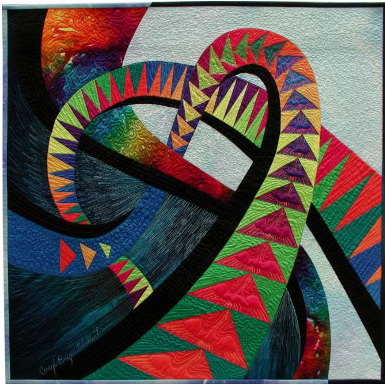
Soaring Compliments • 24" x 24" • Copyright © 2003 Caryl Bryer Fallert • Bryerpatch Studio • www.bryerpatch.com

Bryerpatch Studio • 10 Baycliff Pl. • Port Townsend, WA 98368 • caryl@bryerpatch.com • www.bryerpatch.com