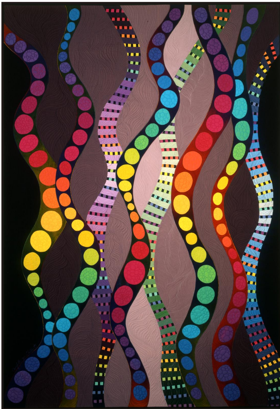
Spirogyra #1 • 65" x 44" • Copyright © 2002 Caryl Bryer Fallert • Bryerpatch Studio • www.bryerpatch.com

Bryerpatch Studio • 10 Baycliff Pl. • Port Townsend, WA 98368 • caryl@bryerpatch.com • www.bryerpatch.com