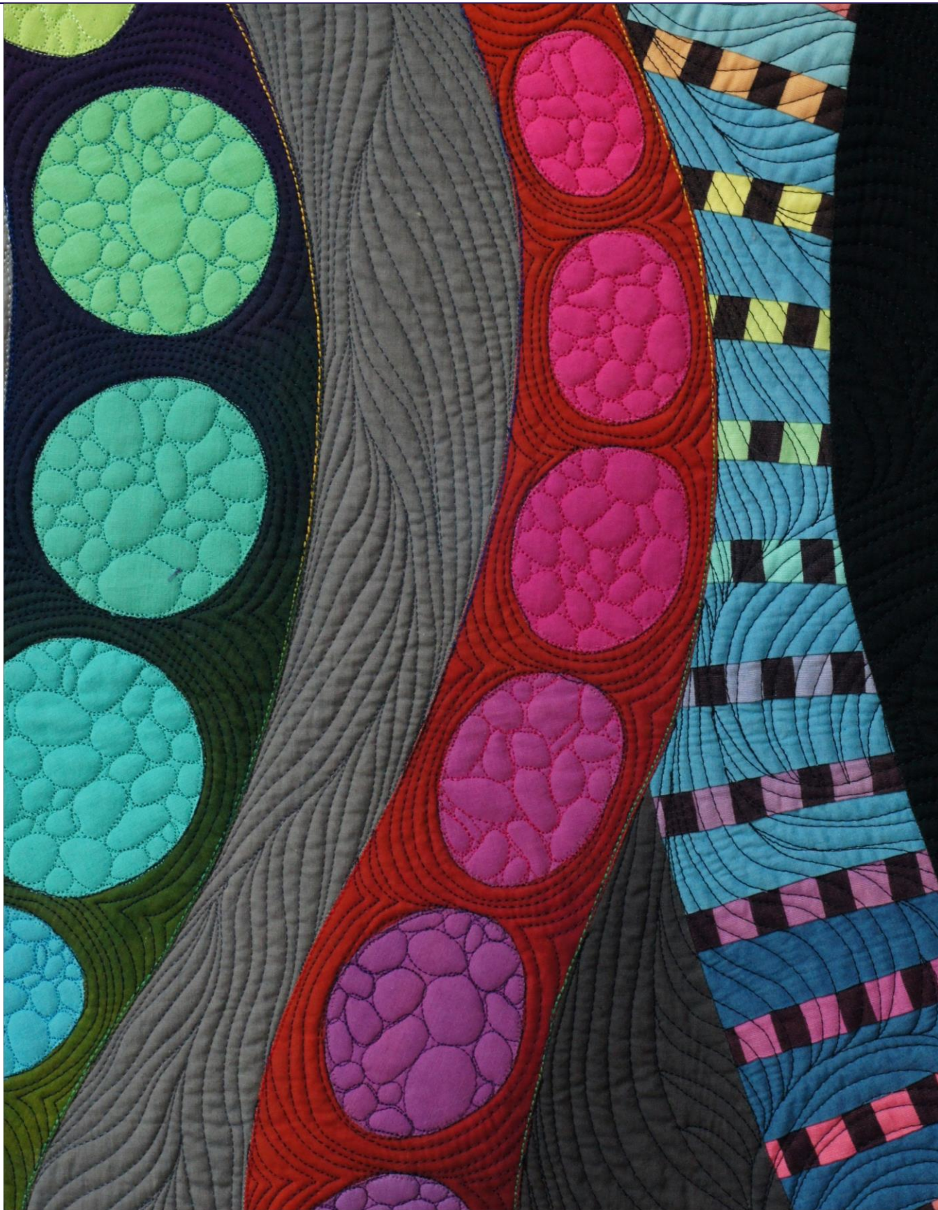
Spirogyra #1 (detail) • 44" x 65" • Copyright © 2002 Caryl Bryer Fallert • Bryerpatch Studio • www.bryerpatch.com