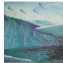
Nice Ice #2: 2020