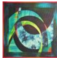
Miniature 2020C: 2020