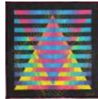
Miniature 2020G: 2020