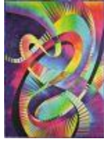
Midnight Fantasy #11: 2020