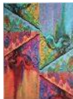
Deception Decomposition #2: 2020