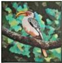
Miniature 2020E: 2020