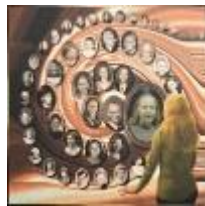
It's All Relative: 2020