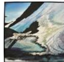
Glacier #1: 2020