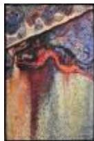
Deception Decomposition #1: 2020