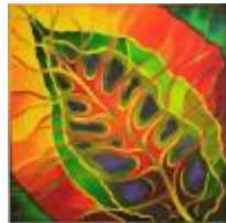
Bradford Fantasy #3: 2020

If some of these look familiar, it's because they are updated versions of designs I made in the past.