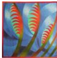
Miniature 2020B: 2020