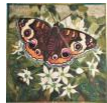
Miniature 2020D: 2020