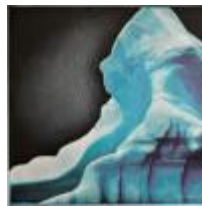
Nice Ice #1: 2020