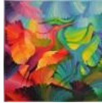
Duet #5: 2020