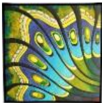
Miniature 2020A: 2020