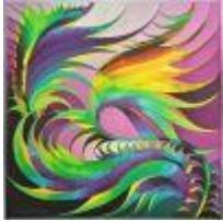
Feather Study #36a: 2020