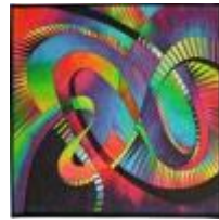
Miniature 2020F: 2020