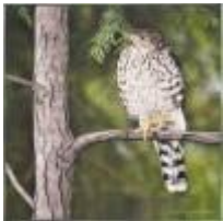
Northern Harrier: 2020