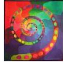
Spirogyra #6: 2020