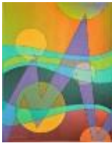
Zigzags & Circles #1