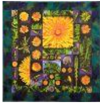
Splendor in the Grass #4