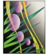
Zigzags & Ellipses#2