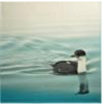
Remote Float #1

Caryl made seventeen new quilts in 2021 in preparation for three upcoming, solo exhibitions this coming Spring and Summer. Click on any picture for the whole story and larger images. All of Caryl’s upcoming exhibitions are listed on her website: www.bryerpatch.com .