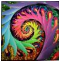
Jacuzzi Jazz #2: