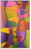
Zigzags & Circles #4