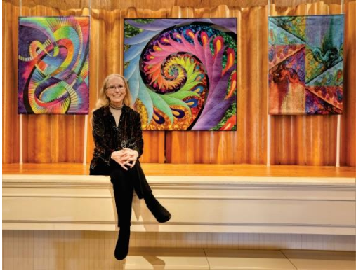
click to see the whole show

NOTE: This is an interactive newsletter. Click on any picture or link for larger images and/or more information.