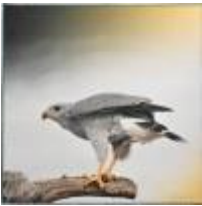
Grey & Gold