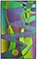
Zigzags & Circles #3