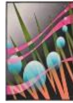
Zigzags & Ellipses#1